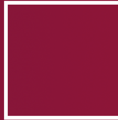
LOCK HAVEN CRIMSON