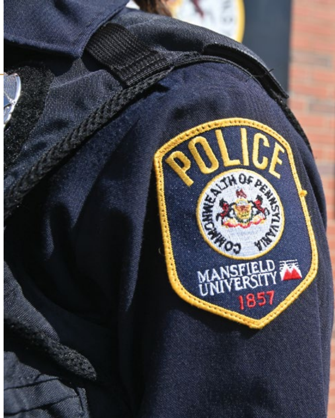
The Public Safety Training Institute at Mansfield is a state leader in non-credit education and training.

Focus on First Responder Mental Health: Workforce Development is creating a mental health division for