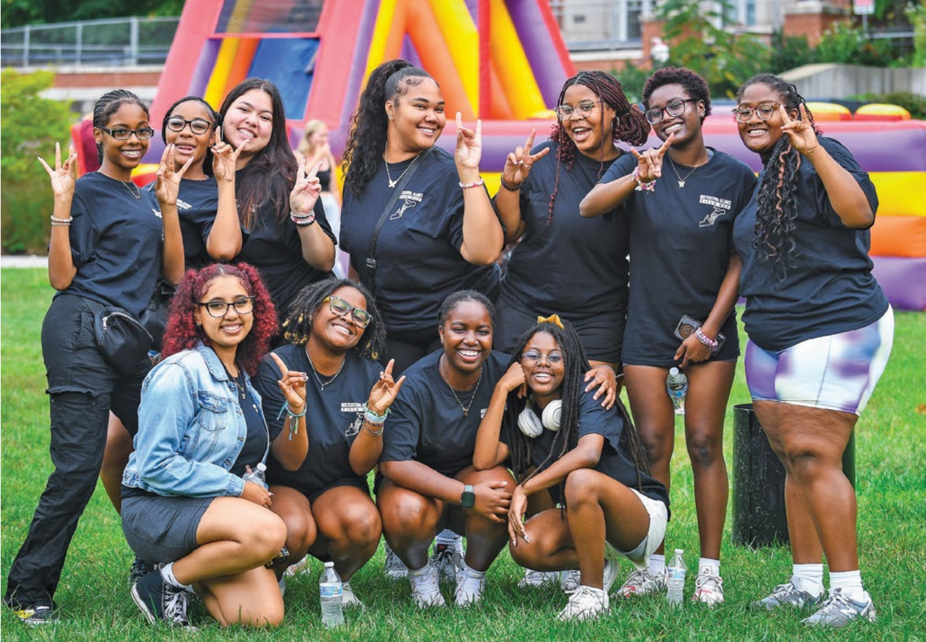
A group of students gather on the Lock Haven Commons during the first Multicultural Alliance Field Day.