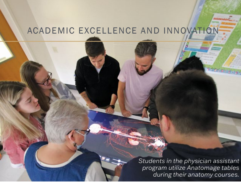
Students in the physician assistant program utilize Anatomage tables during their anatomy courses.