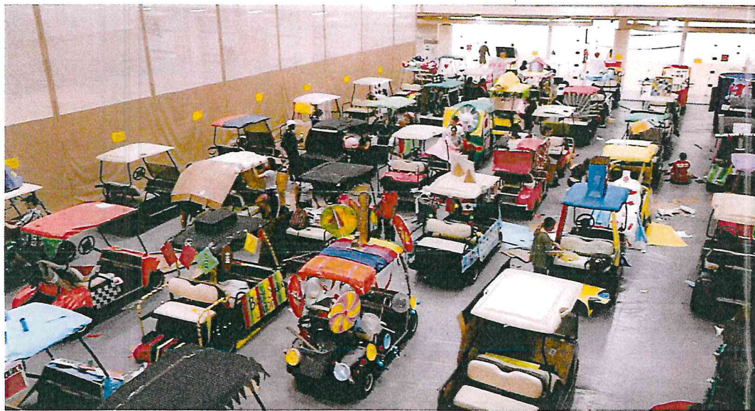
Students decorate golf carts.