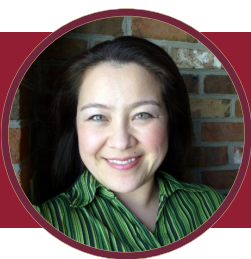
Wren Fritsky College of Health, Science, and Technology

Make an appointment today! commonwealthu.joinhandshake.com professionalu@commonwealthu.edu